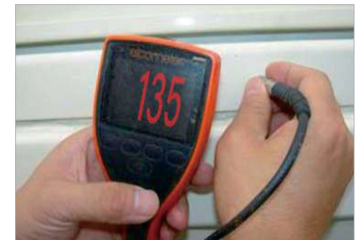
■ Painting Test