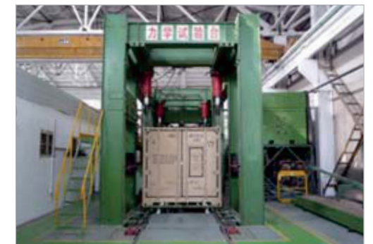
■ Structural Test