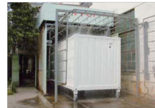
■ Water tightness Test