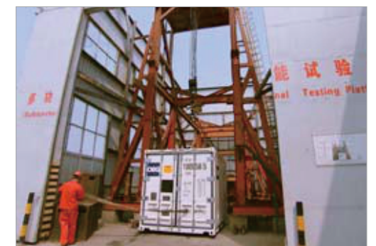
■ Offshore Drop Down Test