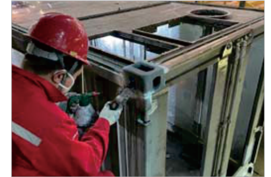
■ MPI Test