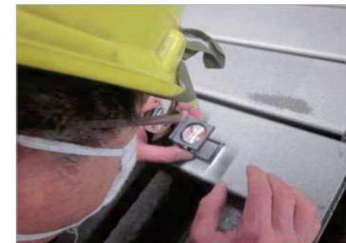
■ Panel pre-treatment Inspection