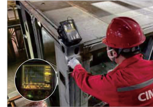
■ Ultrasonic Test